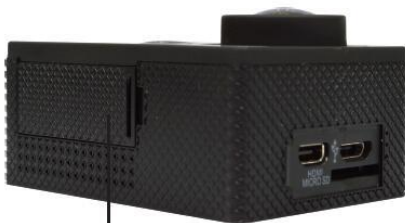
Door of the battery